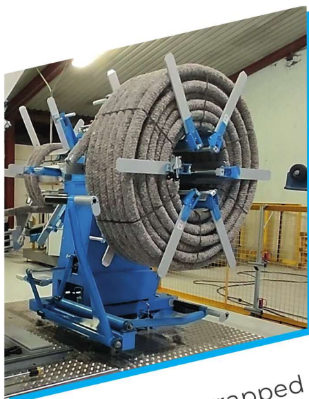
Drainage pipe wrapped with filter: perfect on an ED90DX2